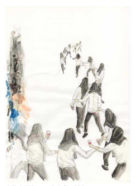
夜的盡頭 | 2024 | 水彩·紙 | 29.7 × 21 cm