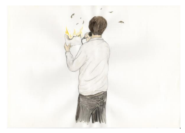
感言 | 2024 | 水彩·紙 | 21 × 29.7 cm

形式或者概念上皆輕盈許多。展場裡展出近百張的水彩插畫,每張圖只有 A4 紙材的大小,尺幅不大卻帶著每日練習、規律作息的身體經驗,回到像是插畫家般追著截稿的死線拚命趕稿的精神狀態。英文展題 Drawing From Monday 便是延續了這種無盡創作的命題,「我規定自己每天至少都要畫上一張,就像是每天都是從禮拜一開始畫的感覺,一直畫、每天畫、沒完沒了的畫。」蘇育賢說道。這些插畫原稿多半來自蘇育賢的筆記本中的隨筆,它們大多是一些靈光閃現的概念草圖、或者某些計畫的分鏡。而這些散落在筆記本裡的插圖之所以落在畫紙上成為了彩圖,契機始於經營出版印刷業的友人送給蘇育賢的幾疊 A4 尺寸紙材。