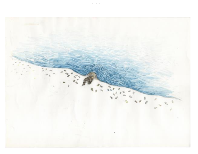
Late Sleep | 2024 | Watercolor on paper | 21 x 29.7 cm

I began killing time, drawing on these sheets of paper, without a specific agenda in mind. Sometimes I draw for the kids; other times, I draw for my wife. Family is the basis of these drawings. I don't have a studio. The only time I leave the house is for film shooting. I write scripts or edit footage right there in the living room, keeping my family company while I work. There's a deeper sense of familial bond in the act of drawing. There's no need to run around. I can share with my kids whatever I've drawn, and they would start drawing, too. For my kids, what I do for a living becomes crystal clear because of drawing.