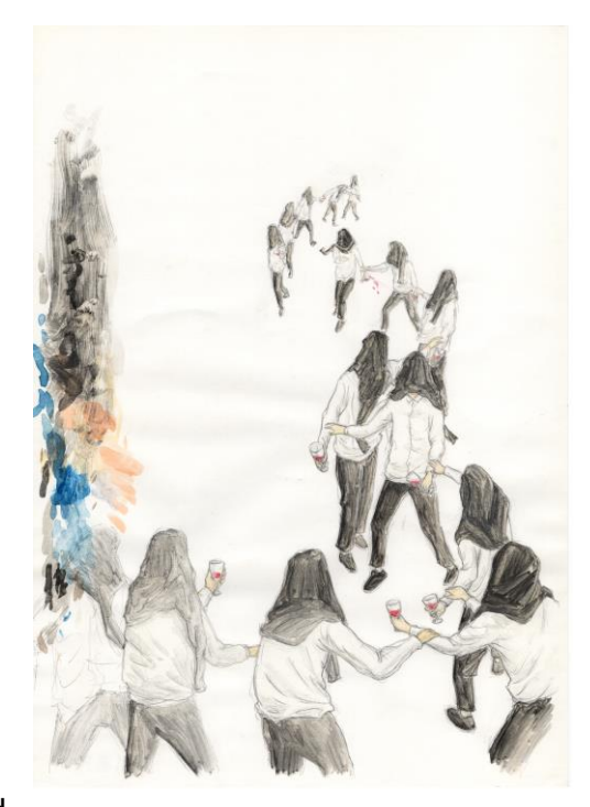
The End of Night | 2024 | Watercolor on paper | 29.7 x 21 cm

It is difficult to define So Yo Hen's creative journey as either linear or binary. His work spans a wide range of experiences and expressions: it includes the frenetic sketches from his early days of pairing with strangers in online chatrooms, and his independent music label "Indi Indi," which features the voice of marginalized individuals with "their insignificant sounds." His piece Hua-shan-qiang (2013) draws on Taiwanese funeral rituals and paper craft to navigate the realms of life and death, blended with political reflections on Taiwan's colonial history and status quo. Plaster Gong (2017) resonates with the fragile sounds of Taiwan's modern identity. The intimate sculpture from the time spent with his sons, encapsulated in the warm nighttime exchange, Goodnight, see you later. (2021), evokes familial bond. In Taman-taman (Park) (2024), he examines with compassion and humor the lives of Indonesian migrant workers, easing the weight of reality with poetic transitions. These diverse themes, be it grand or modest, are captured through So's shifting lens, rendered in different media and his fluid