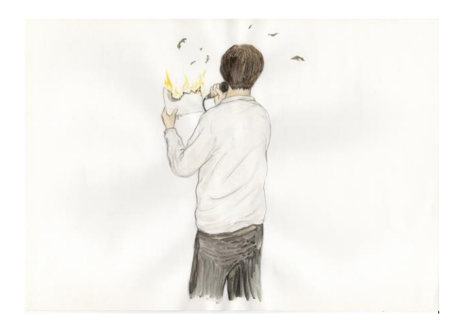
Speech | 2024 | Watercolor on paper | 21 x 29.7

Compared to his previous solo exhibitions, So's latest show Drawing From Monday , comprised entirely of drawings, is much lighter in form and concept. The exhibition features nearly a hundred watercolor drawings, each on A4 size paper. Though small in scale, they embody the artist's daily practice and disciplined routine, reflecting a state of urgency in which an illustrator finds themselves when racing against a deadline. The exhibition title, Drawing From Monday , instantiates the state of constant art making. "I set a rule for myself to draw at least one piece a day, as if every day were Monday. I just keep drawing, nonstop, every single day," So explained. The original sketches for these drawings mostly came from So's sketchbook, where they began as flashes of inspiration or storyboards for various projects. The catalyst for transferring these sketches onto paper as colorful drawings was a gift of several stacks of A4 size paper from a friend who runs a publishing and printing business.