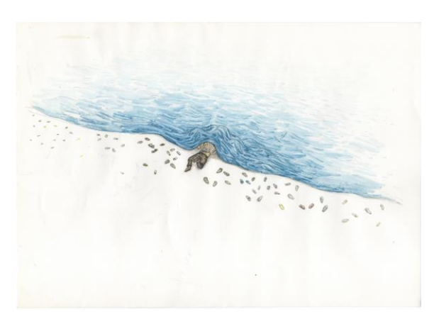
晚睡 | 2024 | 水彩·紙 | 21 × 29.7 cm

「我開始在家裡拿這些紙打發時間,沒什麼目的性的畫,有時候 是為了孩子畫,有時候為了妻子畫。家庭感是這些插圖的基底, 我沒有工作室,除了拍片要跑出家之外,寫腳本、剪片也都是在 客廳裡面,一邊工作一邊陪家人。畫畫這件事情的家庭感又更強 了,不用跑來跑去,作品也可以直接跟孩子們分享,他們也會跟 著一起畫,對孩子現階段來說,我是做什麼樣的工作的,因為畫 畫變得很清楚。」——蘇育賢